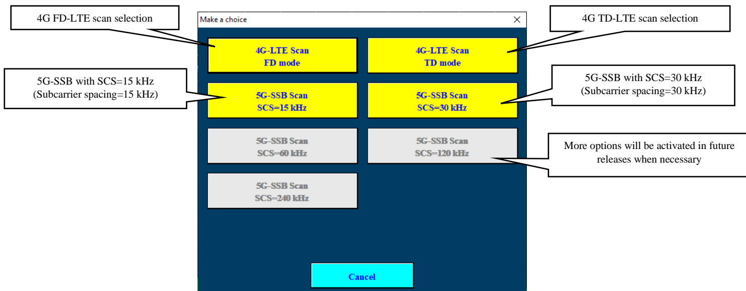
Figure 2, the new “4G/5G Blind Scanner” test display.

Once search is finished within the specified frequency range, this button will be activated. Once pressed, the discovered frequencies will be saved to a CSV file as well as to an internal user frequency list.